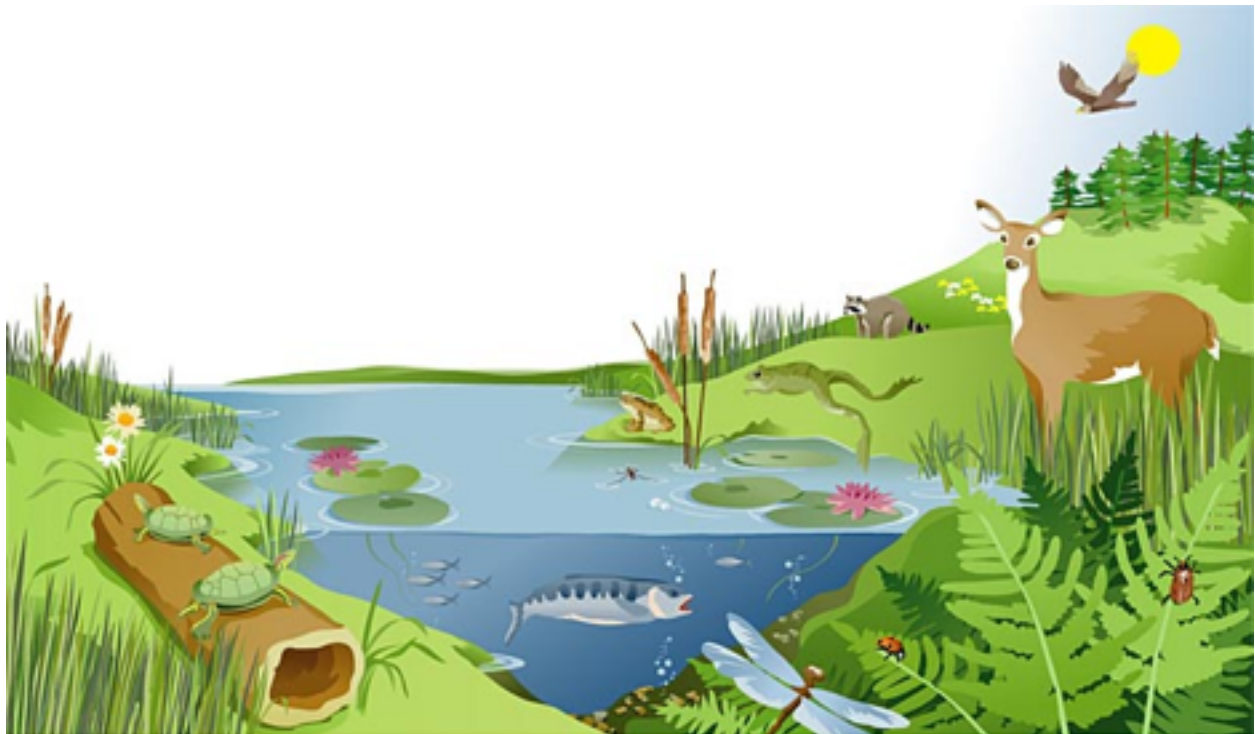
Illustration by Jeff Grader / property of Delta Education